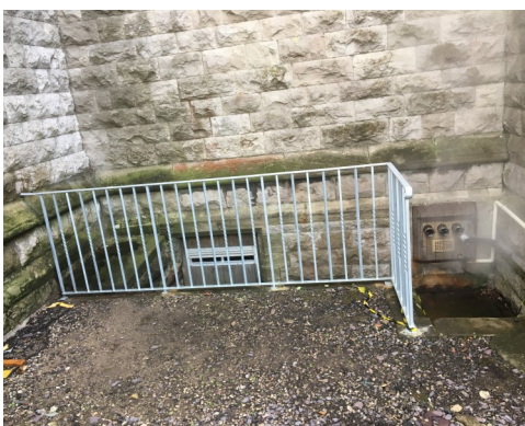
Left: Out of sight but not out of mind - another church -wardens' responsibility wardens is the boiler room - new railings for the steps.

In between all this, we need to find time to look at the future of the church hall. A meeting was held recently to discuss its future. It was erected in 1974/5 and is close to being life-expired. The deterioration of the gutters and fascia boards is obvious in this recent view, pictured below. But we need to keep it standing for a little bit longer, which is why some emergency repairs may be carried out in the not too distant future.