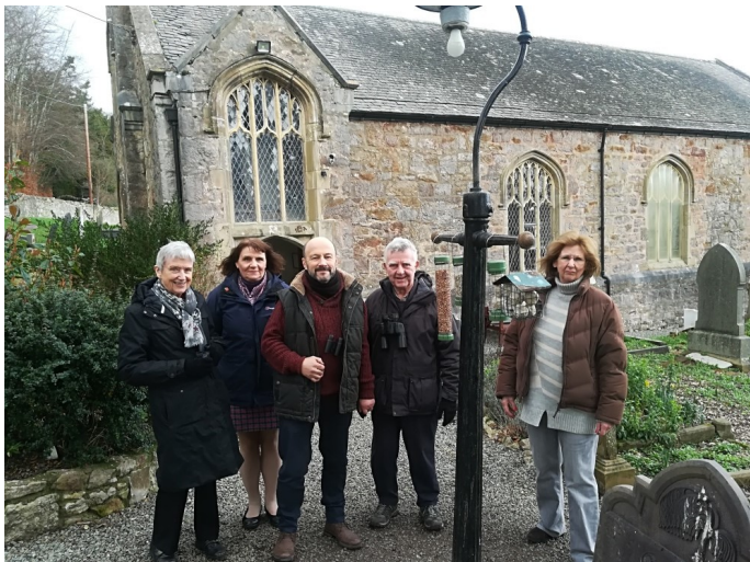
Above: Some of the participants in the RSPB Big Garden Birdwatch at St Cystennin's